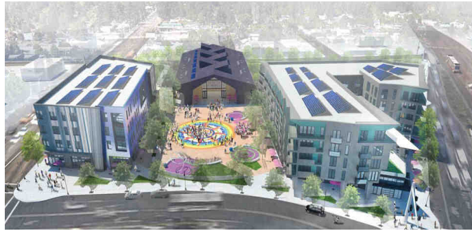
Rockwood Rising, (left to right) buildings A, C, & B surround the plaza

Thousands of local stakeholders participated in the visioning for <u>Rockwood Rising</u> which identified access to healthy, affordable food and economic opportunities as the highest priorities.