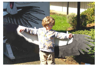
Welcome Back Vulture Day, Nadaka

Friends of Nadaka is excited to announce that for the fourth year in a row, we are once again hosting the <u>Welcome Back Vulture Day</u> festival on Saturday, March 16th from 12-3pm, in partnership with the <u>Audubon</u> <u>Society of Portland</u>. This free, family-friendly event is filled with educational activities, live birds, food, games, and