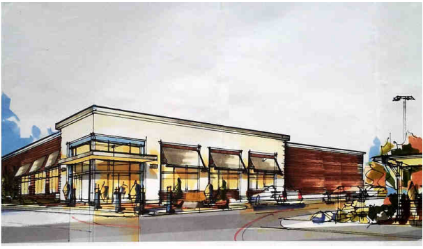
Proposed $.1.3M Walgreens at 179th & NE Glisan St. Completion in 2015

The site is located on the north side of NE Glisan Street just west of NE 181st