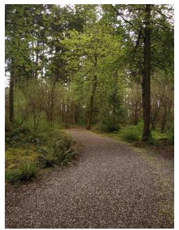
Nadaka Cherry Blossoms