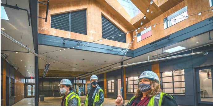
Construction progress, Rockwood Market Hall.