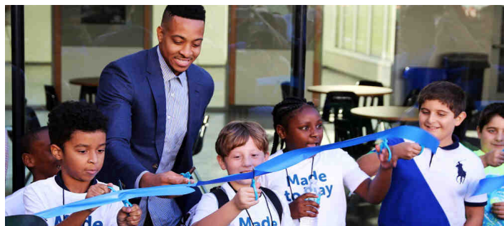
Boys and Girls Club, Rockwood ribbon cutting. Funded through Rockwood West-Gresham Renewal Plan.

For more information go to: https://greshamoregon.gov/Urban-Renewal/ ■