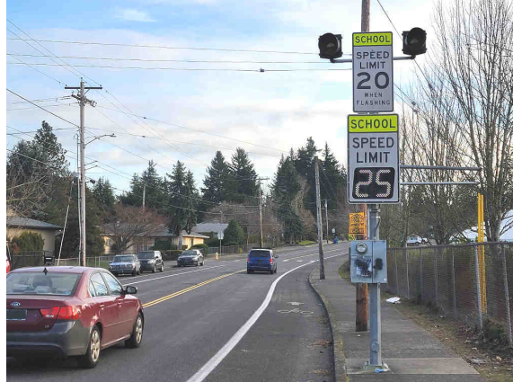
Radar speed sign at NE 172nd Avenue & NE Clackamas Street