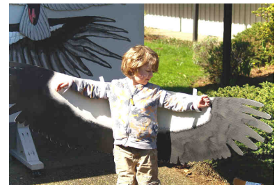
Welcome Back Vulture Day, Nadaka

Friends of Nadaka is excited to announce that for the fourth year in a row, we are once again hosting the Welcome Back Vulture Day festival on Saturday, March 16th from 12-3pm, in partnership with the Audubon Society of Portland . This free, family-friendly event is filled with educational activities, live birds, food, games, and more! Attendees will have the opportunity to meet Ruby, Portland Audubon's live Turkey Vulture, along with many of Audubon's other education birds. Other activities will include comparing your wingspan to that of a California Condor, exploring the varied cultural significance of different birds, enjoying a scavenger hunt and bird walk in Nadaka Nature Park's forest, and crafting your own unique bird mask! Learn more about this event at Audubon Society of Portland's website: http://audubonportland.org/ .