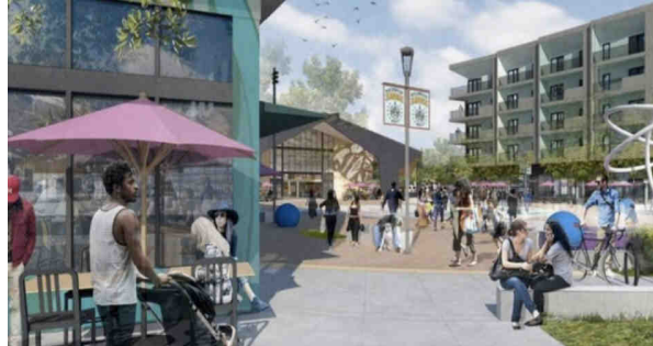
Rockwood Rising view northwest from SE 187th & SE Stark St