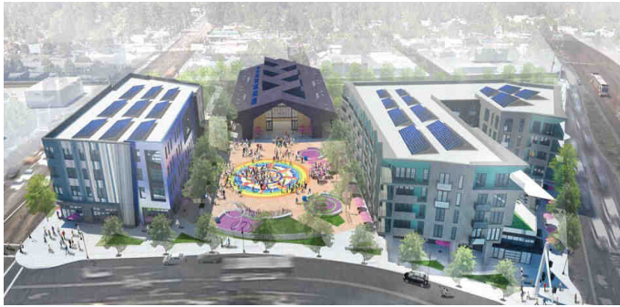
Rockwood Rising, (left to right) buildings A, C, & B surround the plaza

Thousands of local stakeholders participated in the visioning for Rockwood Rising which identified access to healthy, affordable food and economic opportunities as the highest priorities.