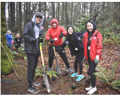
MLK Day Volunteers at Nadaka Park