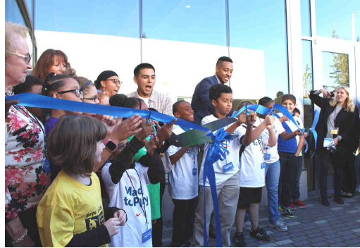
Rockwood Boys & Girls Club ribbon cutting Oct 9, 2017

The facility also features a full size gymnasium, providing the resources and inspiration to bring sports and fun into the lives of Club members and countless others – made possible thanks to Nike, Inc.