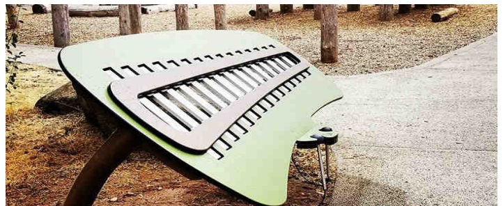
Giant Xylophone, Nadaka Nature Park, Gresham OR