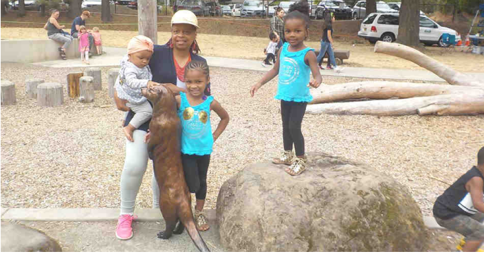
Kids explore the bronze otter statue at Nadaka Nature Park, Gresham OR