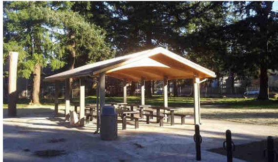
New picnic shelter at Nadaka Nature Park and Gardens, 176th & NE Glisan

A big thanks to Alpha High School students who planted over 400 hundred plants in the rain gardens along NE Pacific Street February 23rd. The project was funded by Federal CDBG funds and will