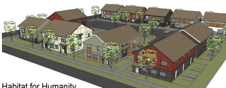
Habitat for Humanity Glisan Gardens, 25 energy efficient homes available Dec 2015