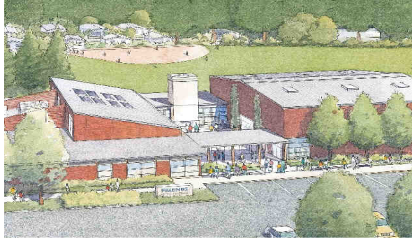
Friends of the Children youth center design, 424 NE 172nd. Opening Fall 2015

Friends of the Children , a Portland non-profit, is making a significant investment in the East County community. The non-profit agency has begun the final planning phase of their budgeted $5 million project—an 8,500-square-foot youth center located next to Pat Pfeiffer Park on NE 172nd Ave.