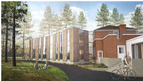
New 4,000 sq.ft. 2-story addition to historic Louise Home

Built in 1925 as a juvenile hospital offering maternity services for dependent girls, the historic Albertina Kerr Louise Home will undergo its first major renovation in more than 30 years.