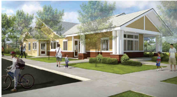
Albertina Kerr's proposed 6,000 sq. ft. addition to West Gresham facility, NE 165th Ave

The additional space will allow the facility to serve approximately 25% more children