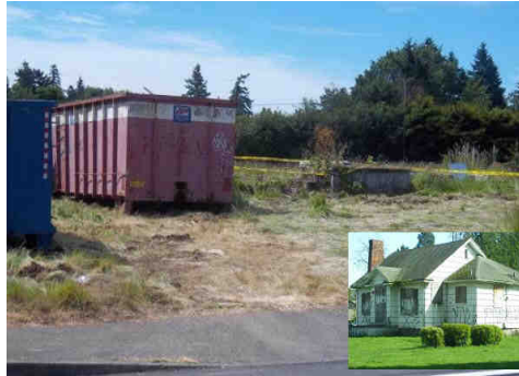
Habitat for Humanity Site, 165th & Glisan. Original home inset.

Homeownership also has a profound effect on education. Low-income families in Multnomah County average one move every 15 months, chasing affordable rents. This