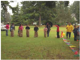
Sack race at the 2011 Festival

Fun for the Entire Family! Music, Food & Activities