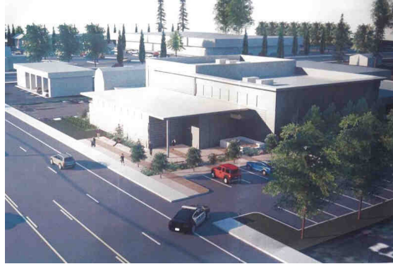
Artist's concept, new Rockwood Public Safety Facility, 675 NE 181st

The Gresham Redevelopment Commission is moving forward on the design and construction of a new Police facility in the Wilkes East Neighborhood located at the former Kasch's Garden Center site at 675 NE 181st Avenue.