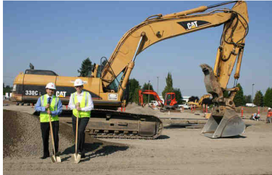
Medcure breaks ground on state-of-the-art surgical training center

The City of Gresham is finalizing building permits for the creation of a Surgical Training Center at the northeast corner of 181st Avenue and Sandy Boulevard.