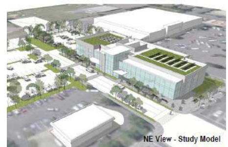
NE View - Study Model

After years of delays and missteps, Multnomah County commissioners unanimously approved the design for a new East County Courthouse in Rockwood.