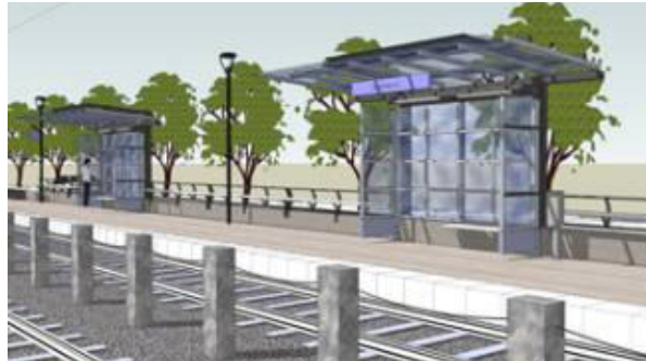
New Rockwood MAX station shelter design, 188th & E Burnside

Look for big changes starting this summer, as the Gresham Redevelopment Commission begins transforming the face of Central Rockwood with a distinctive urban design.