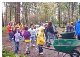
Hollydale Elementary students, teachers, and parents remove invasives from Nadaka Park

Nadaka Nature Park is a lovely 10 acre natural area of second generation Douglas Fir forest with an under-story of native plants in the Wilkes East Neighborhood. Nadaka offers a quiet, woody escape with it's .46 mile walking trail loop and an open meadow on the south. The Wilkes East Neighborhood Association (WENA) is actively working to restore this natural area by removing invasive blackberry, ivy, and holly with volunteer work parties. Entrance to the park is near NE 175th & NE Pacific St.